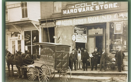
Dushore, Early 1900's